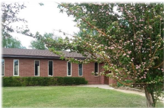
Unitarian Universalist Fellowship of Laramie

Coffee and conversation today will be warm, tasty, and fun! Join the conversation!