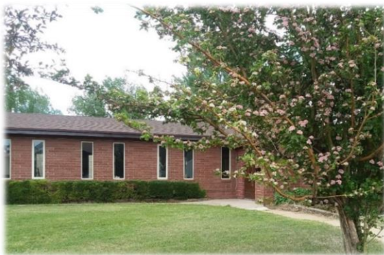
Unitarian Universalist Fellowship of Laramie