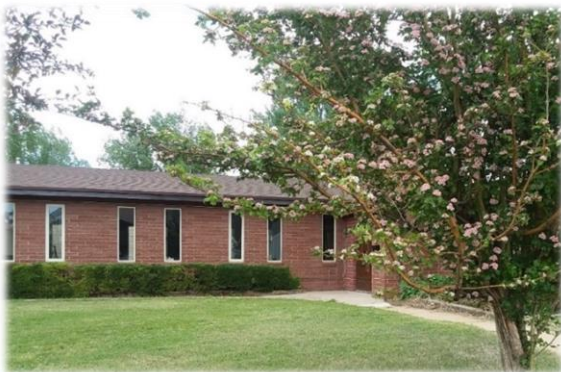
Unitarian Universalist Fellowship of Laramie